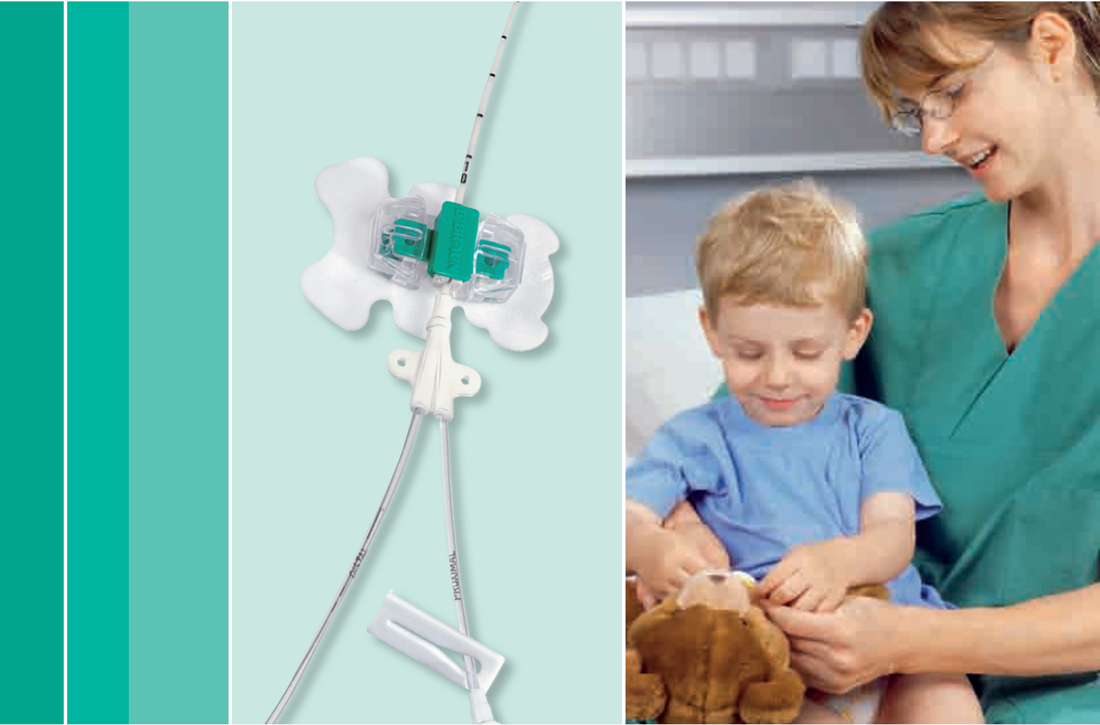
Central Venous Catheters

World wide unique. Certofix® with kink-proof guide wire for infant and child patients.